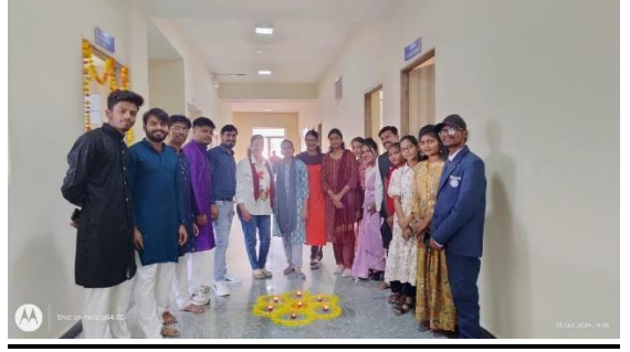
Fresher's Day 2024 – 14/11/2024